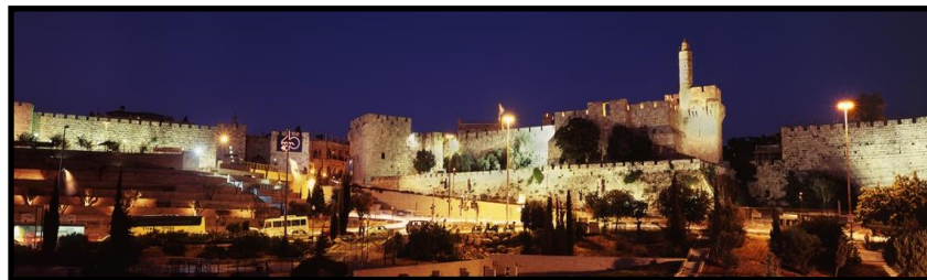
Jerusalem Old City Wall and Jaffa Gate

We begin today by visiting the Israel Museum ; the Shrine of the Book where some of the Dead Sea Scrolls are on display and see a scale model of Jerusalem from New Testament times. We will visit the Knesset (Israel's Parliament), visit the Valley of Elah , where David defeated Goliath of Gath plus other fascinating places in the region including cities like Ashdod and Ashkelon . Mananzay Attuda Market, The American Cemetery in Jerusalem, Emmaus and Kiryat Jearim are on the agenda.