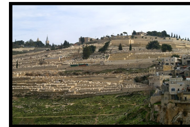
Mount of Olives

DAY 12 —Our flight home is a good time to catch up on journaling and remembering the special memories of the tour. Who knows, you may even get some sleep! We will arrive home ready to tell everyone what we have seen and learned and hoping we will visit Israel again!